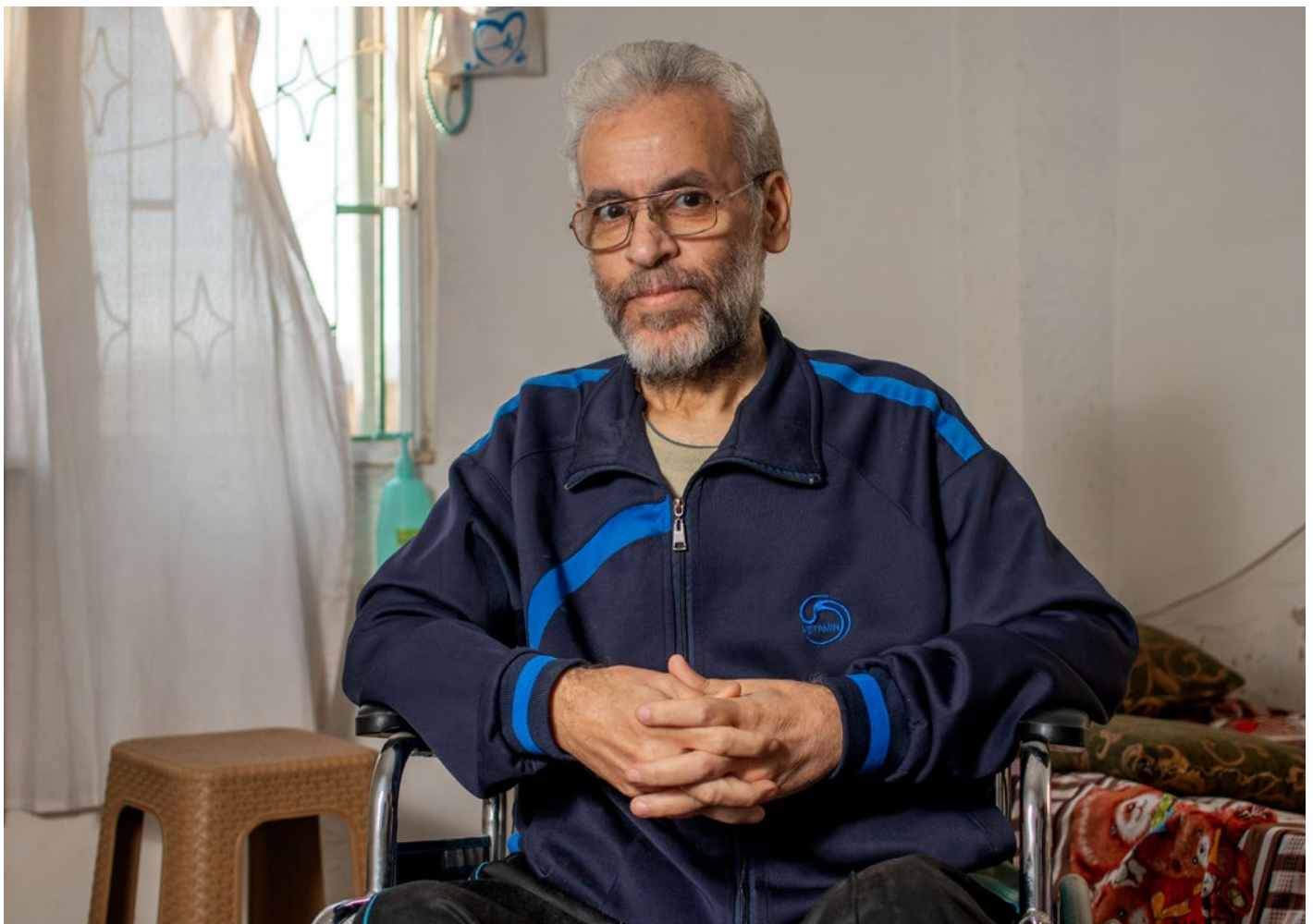
Haitham Matouk/HelpAge International

These rights have not been specifically applied to older people in the existing international human rights framework. This leads to a lack of clear guidance on States’ obligations and a lack of implementation in practice. 25 They need to be included in a new convention on the rights of older people.